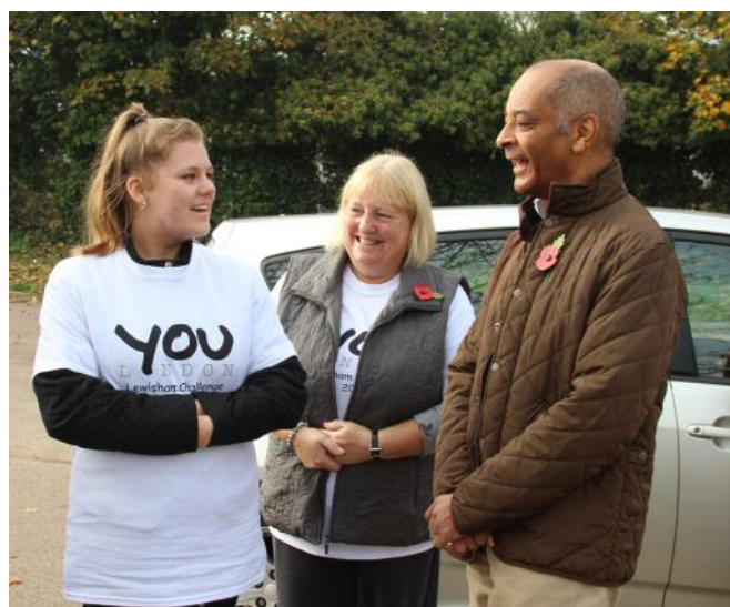
The Lord-Lieutenant and Vice Lord-Lieutenant visiting a YOU competition

The Lord-Lieutenant is a great supporter of YOU London as a former St John Ambulance Cadet (and proud holder of the Grand Prior's Award!). He has also recently taken over from Field Marshal Lord Guthrie as Patron of London Youth and he looks forward to closer cooperation between the organisations.