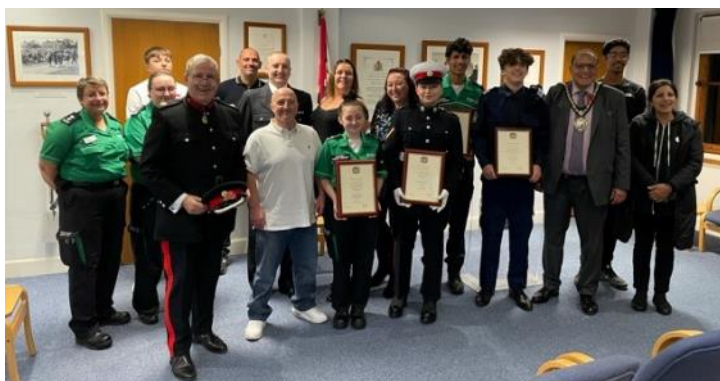
Deputy Lieutenant Certificates being presented in Hillingdon, November 2021